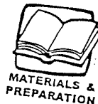
MATERIALS & PREPARATION